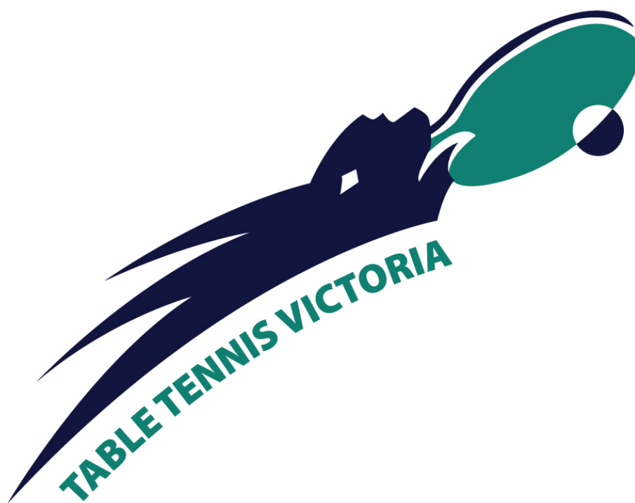
Table Tennis Victoria Inc. 83 rd Annual Report 2012