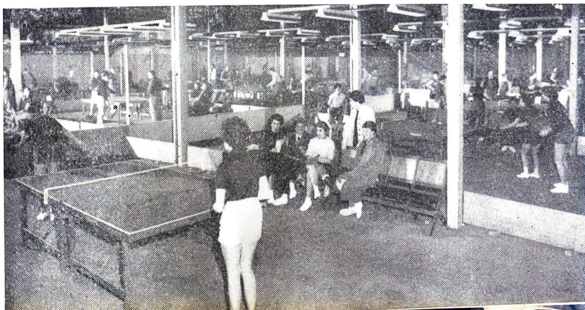
Below: An interior scene taken during Country Week Championships.