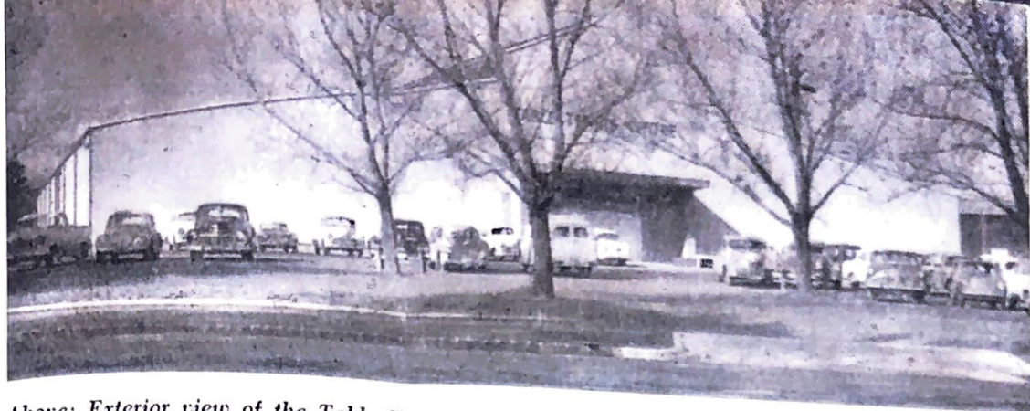
Above: Exterior view of the Table Tennis Centre.