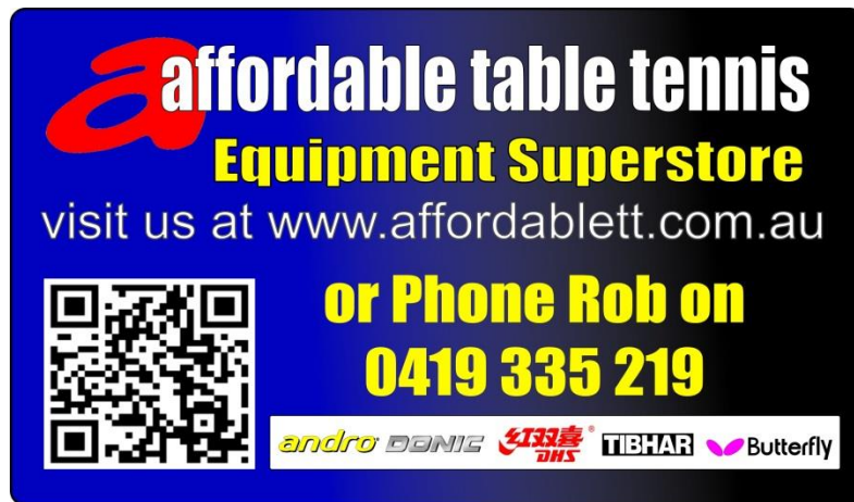
Table Tennis Victoria Partners