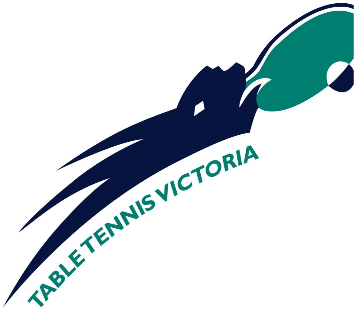
Table Tennis Victoria Inc.