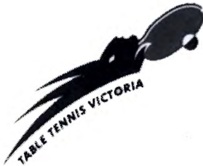
TABLE TENNIS VICTORIA INC