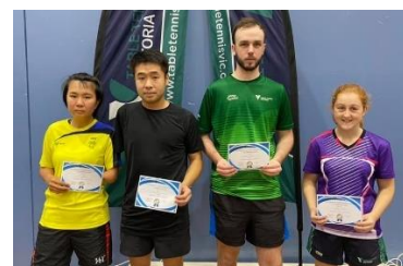
Mixed Open Doubles