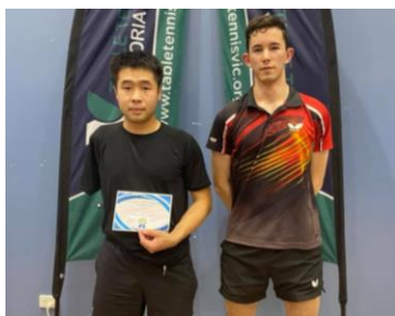
Men's Open Singles