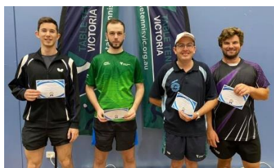
Men's Open Doubles