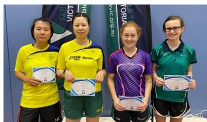
Women's Open Doubles