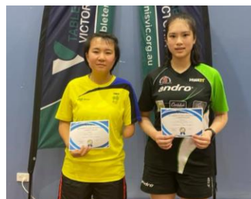
Women's Open Singles