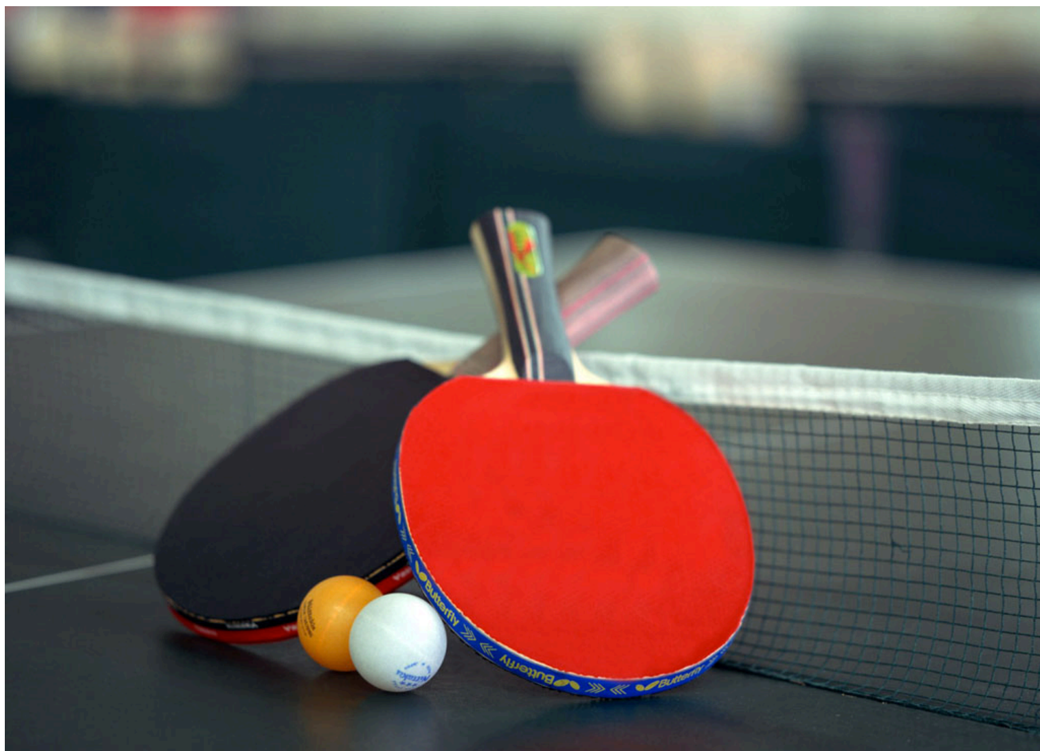
Table Tennis Victoria Inc. 84 th Annual Report 2013