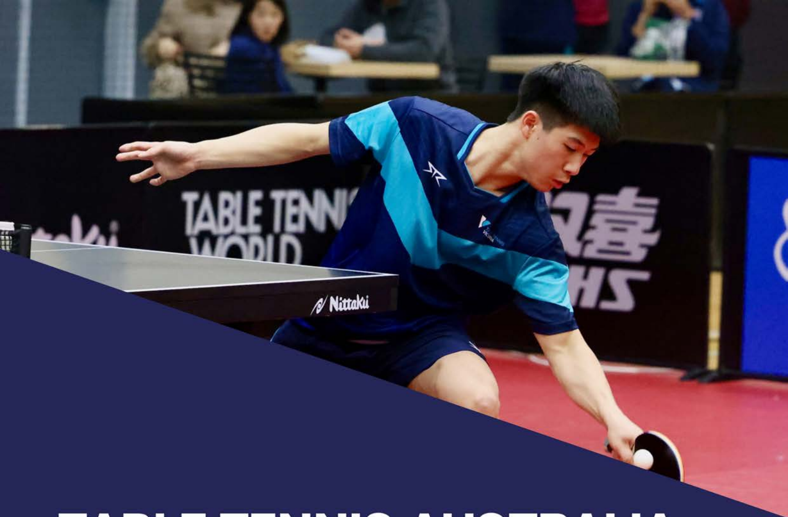
TABLE TENNIS AUSTRALIA & TABLE TENNIS VICTORIA Affiliation Information Pack 2023