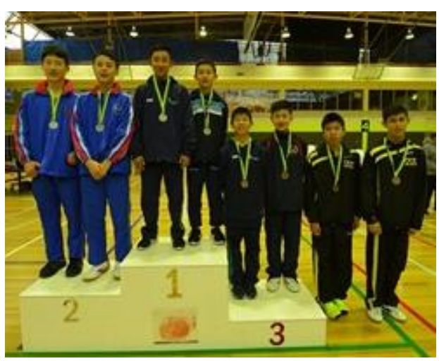
U/15 Boy's Doubles