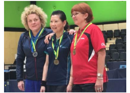
O/50 Women's Singles