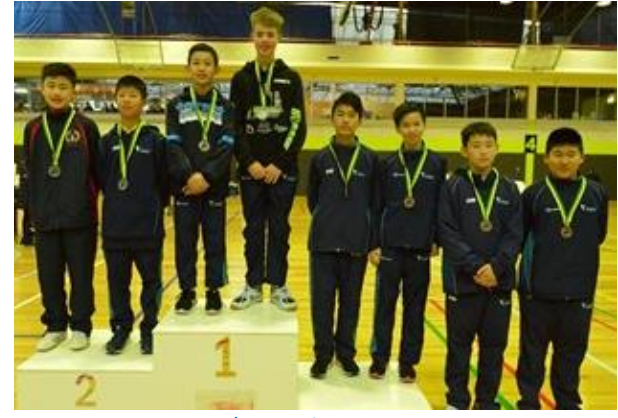
U/13 Boy's Doubles