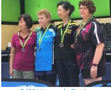
O/60 Women's Singles