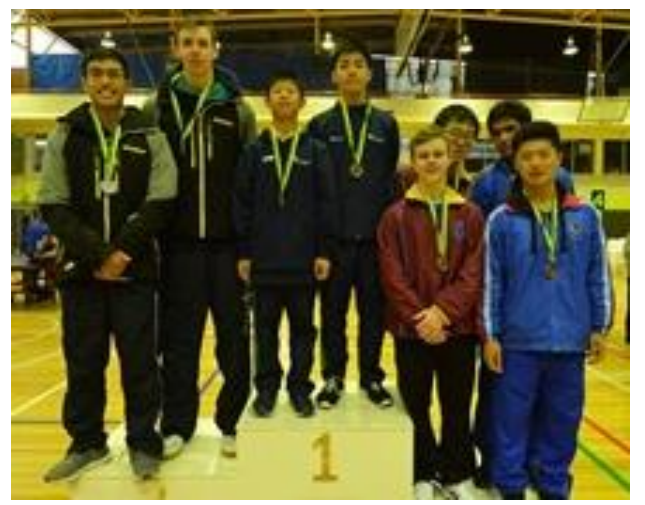
U/18 Boy's Doubles