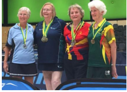
O/70 Women's Singles