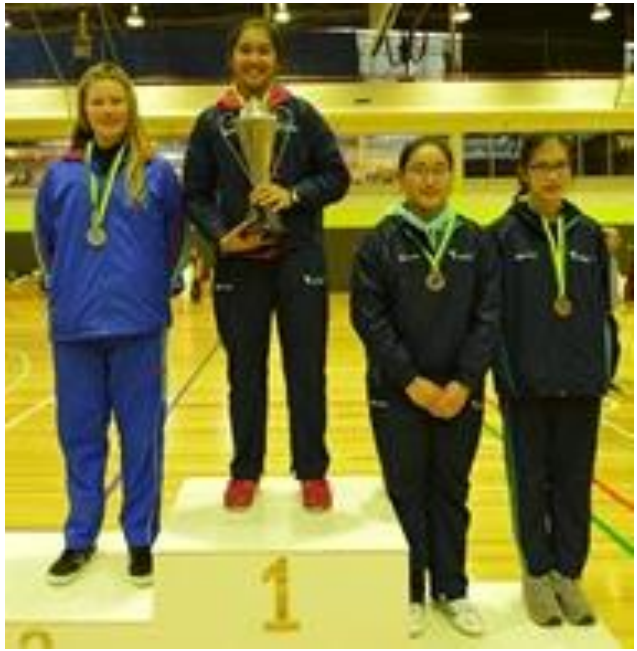
U/15 Girl's Singles