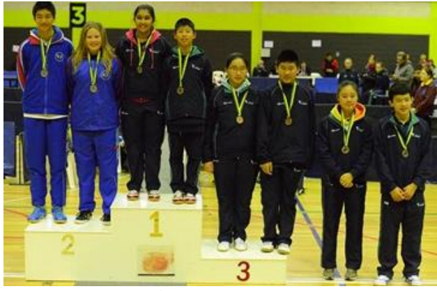
U/15 Mixed Doubles