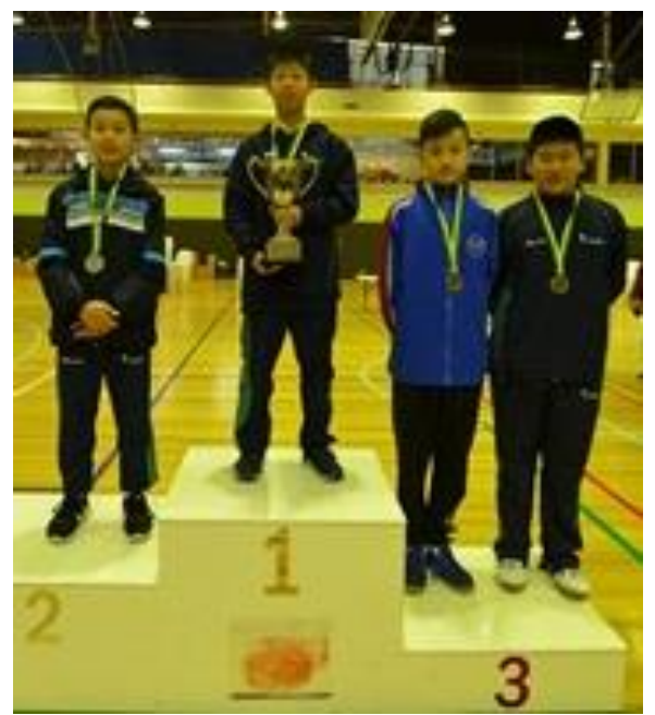
U/13 Boy's Singles